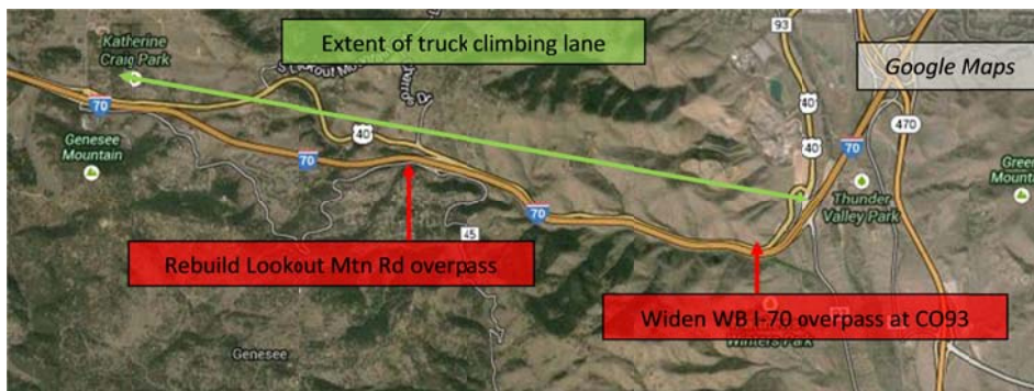
Figure 5: Hypothetical truck climbing lane project.

This project would construct a truck climbing lane on westbound I-70 near Denver (Figure 5). Westbound I-70 has three lanes for the length of the project area. Most vehicles travel at or near the speed limit of 65 mph, but trucks in the far right line often travel as slowly as 5 mph. This creates occasional congestion and accidents as vehicles attempt to pass trucks, or attempt to pass slower vehicles passing trucks. (This is a strictly hypothetical project to provide another example of construction/operations emissions tradeoffs; to our knowledge, the Colorado Department of Transportation is not planning such a project.)