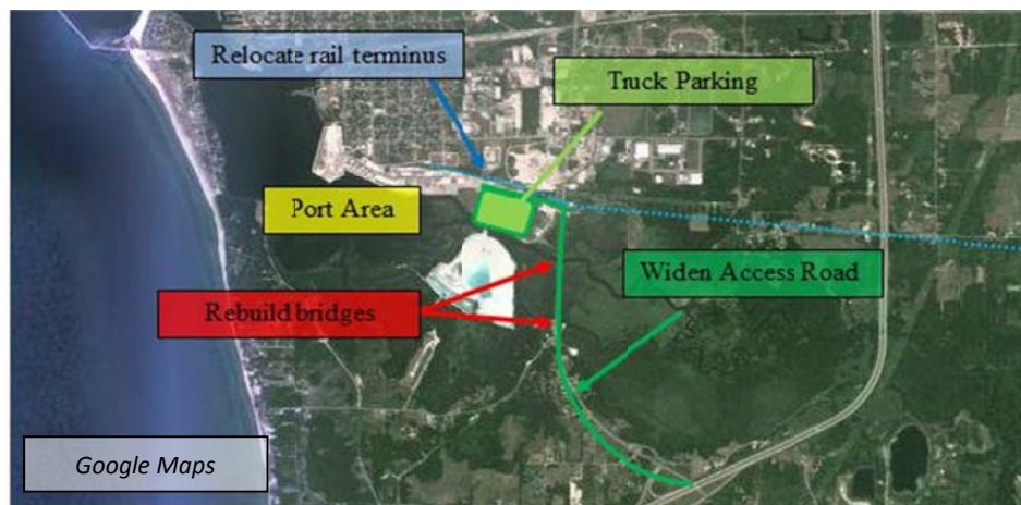
Figure 3: Proposed project.

The proposed project would create a new truck access route by widening the existing southern access roadway, and rebuilding two bridges. The project would also create 100 spaces of truck parking. This would require relocation and extension of the final half-mile of the rail access line (see Figure 3).