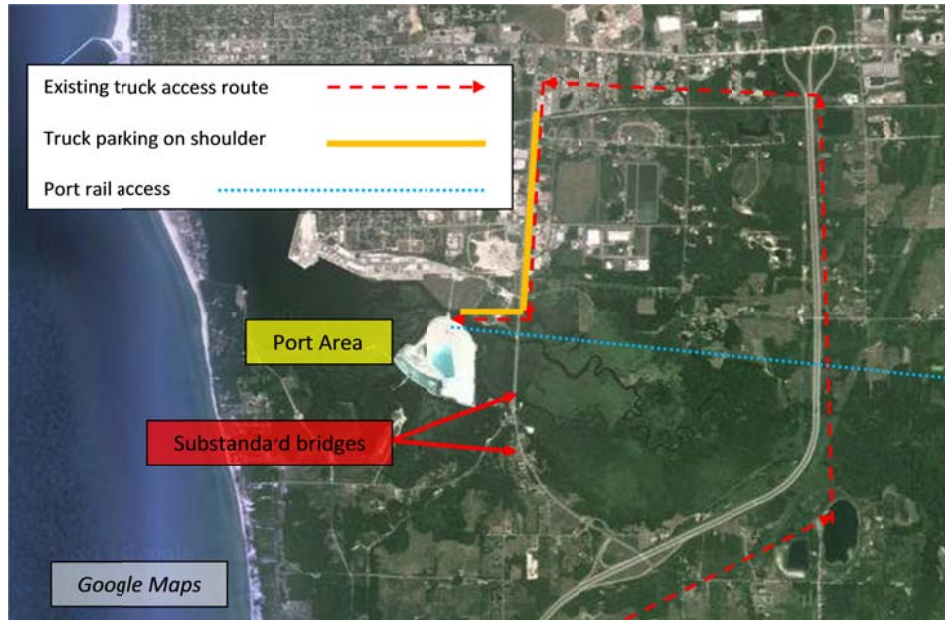
Figure 2: Existing conditions (No Build).

The proposed project would create a new truck access route by widening the existing southern access roadway, and rebuilding two bridges. The project would also create 100 spaces of truck parking. This would require relocation and extension of the final half-mile of the rail access line (see Figure 3).